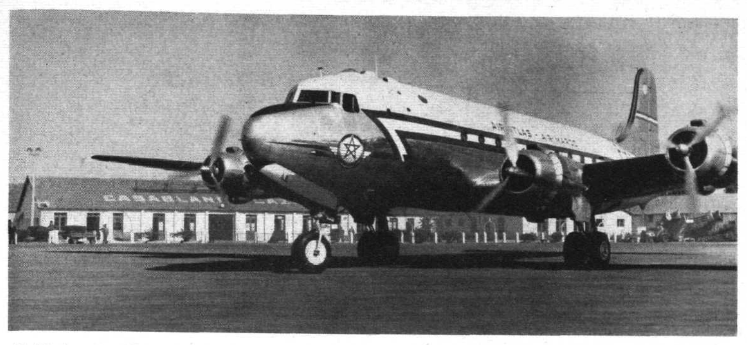
Air Atlas have three DC-4s, one of which is seen at the company's base at Marakech, Casablanca, one of the finest airports in North Africa.